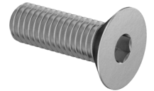
M8x25mm Countersunk Bolt